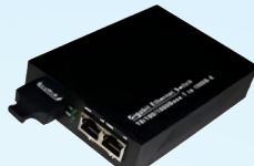
Optical fiber transceiver