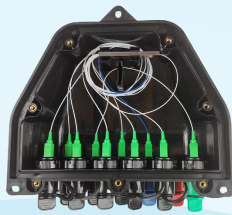
1x9 unbalanced splitter