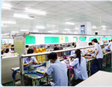
patch cord production line