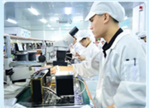
WDM production line