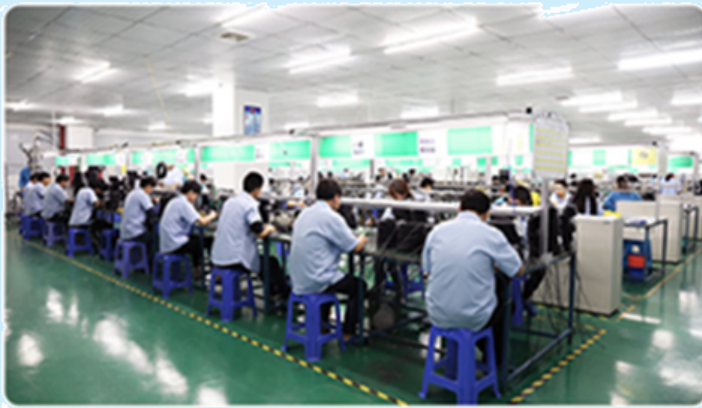
FTTA cable production line