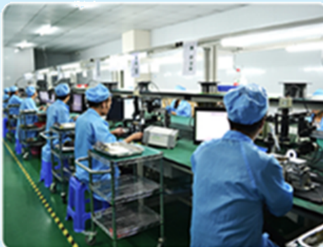
PLC production line