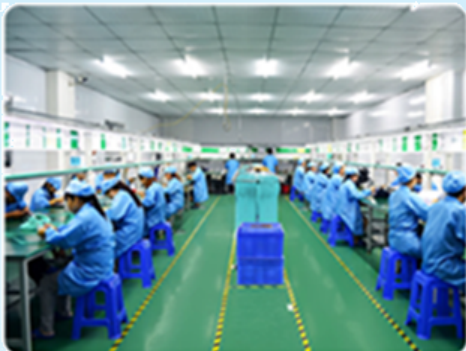
MPO cable production line