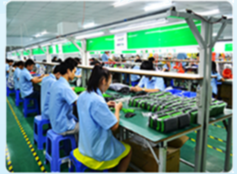
connector production line