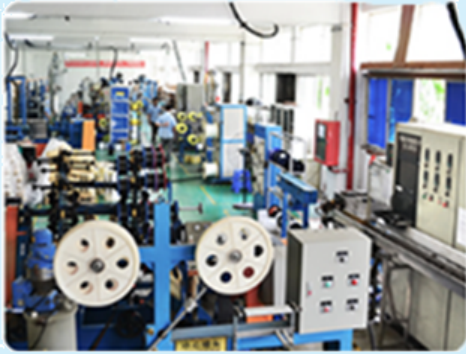
cable production line