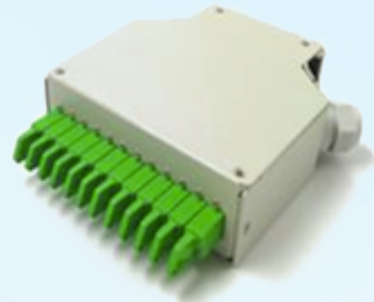
12 E2000 DIN Patch Panel