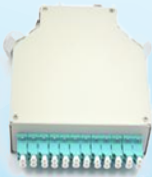
12 LC Duplex DIN Terminal Box