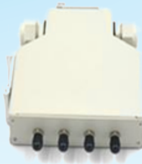
4 ST Simplex DIN Splice Box