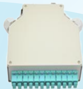
12 SC Simplex DIN Patch Panel