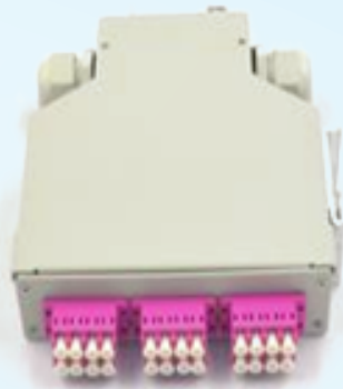
6 LC Quad DIN Splice Box