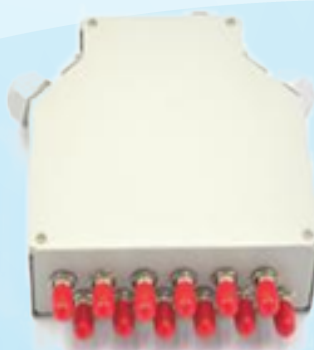
12 ST Simplex DIN Splice Box