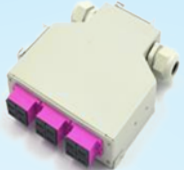
6 SC Duplex DIN Patch Panel