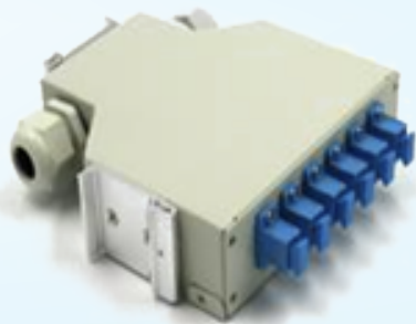
6 SC Simplex DIN Terminal Box