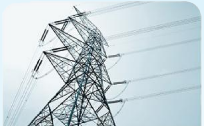
Optical fiber wiring