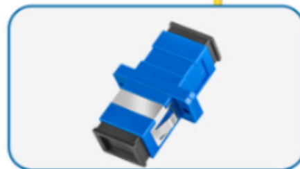
Fiber adapter loss \leq 0.3\text{dB}