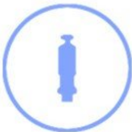
G.657A Fiber Core