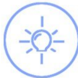
Uniform light distribution